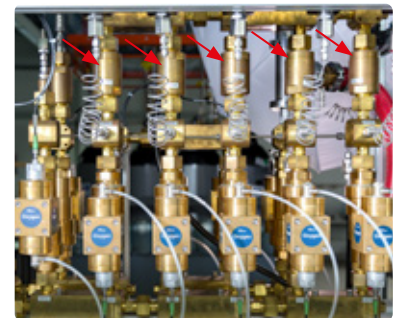
Example of use: